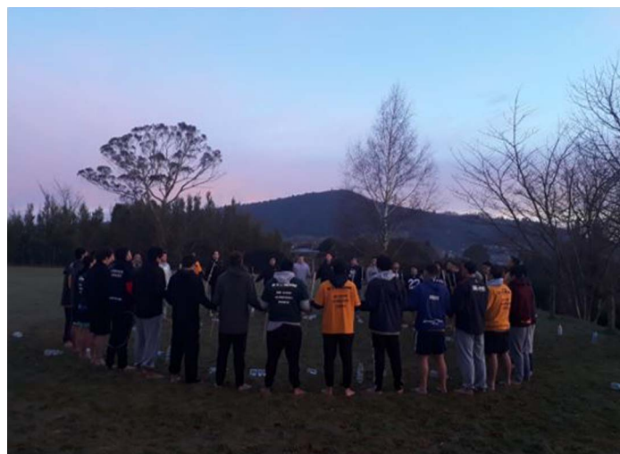
Figure 3 — Rangatahi e tū toa, hei tū he rangatira: Māori youth standing strong as leaders.

This article has also argued that we need to know more about Indigenous approaches and practices to sport for social change. This is best done as a “native” researcher or pracademic who can empathize with principles underpinning Indigenous initiatives in research and practice such as perspective, privilege, politics, protection, and people.