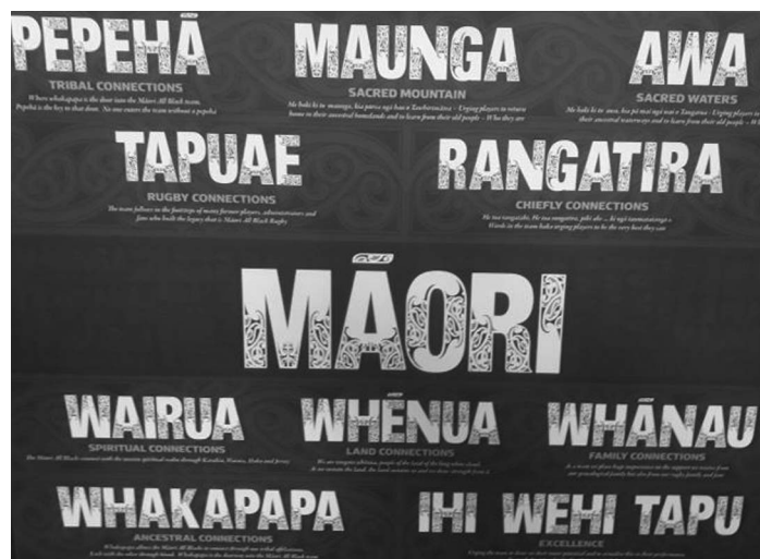
Figure 2 — Canvas picture taken from inside the wharenui.

Waypoint 4: Deepening practices. The social well-being of individuals and groups also relates to Waypoint 4 and the interconnectivity between peoples’ values with practices to support a holistic view that secures interpersonal relationships. On game-day morning,