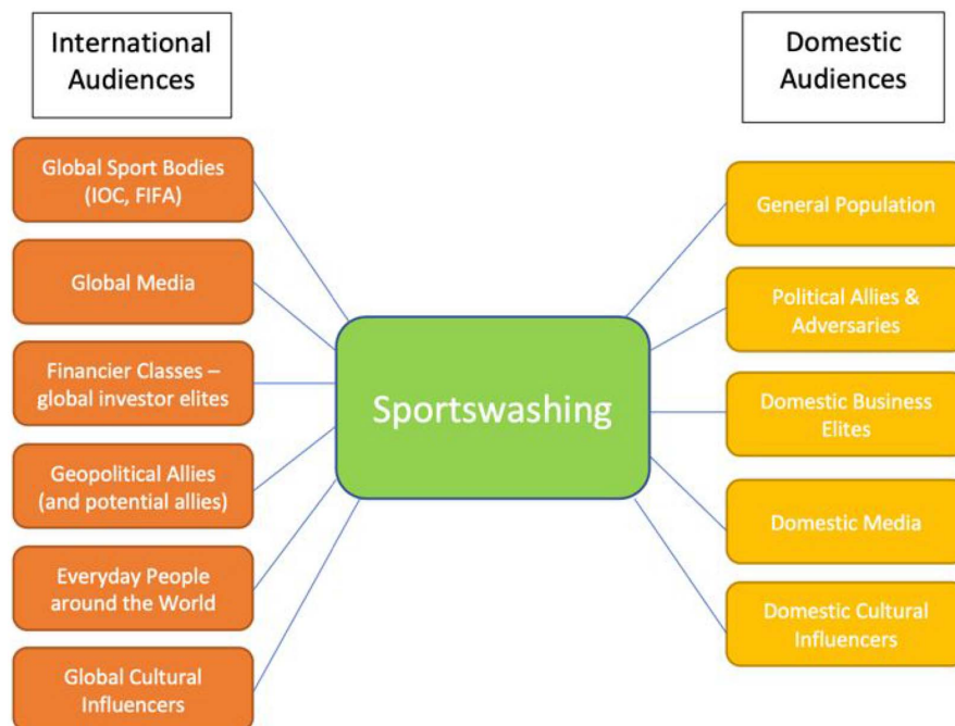
Figure 1 — Sportswashing can be geared toward both international and domestic audiences. IOC = International Olympic Committee. This figure was inspired by "For the Benefit of Our Nation": Unstable Soft Power in the 2018 Men's World Cup in Russia," by S.D. Wolfe, 2020, International Journal of Sport Policy and Politics , 12(4), pp. 545–561.

The Sochi Olympics were part of a larger modernization program in Russia, a fact often missed by Western observers. According to both the independent polling agency Levada and Russian news outlet Novosti , Putin achieved unprecedented popularity in the wake of the Sochi Games, leaping to an all-time high approval rating of almost 86% in May 2014 (Grix & Kramareva, 2017, pp. 463–464). Part of this popularity can be attributed to the fact that after the Olympics concluded and before the Paralympics commenced, Russia invaded the Crimean Peninsula and subsequently annexed it, snatching the region from Ukraine. But the successful invasion points to a key idea: hosting the Olympics revs up domestic publics in ways that can soften up the political terrain for war. For an international audience, the Crimea invasion was evidence of a dangerous renegade state. For the domestic audience inside Russia, it symbolized Russian strength and the inability of Western rivals to stop a nation on the rise, even as those adversaries condemned the military incursion; these were exactly the same messages delivered via the Sochi 2014 sportswash. Grix and Kramareva (2017, p. 468) assert the invasion, following on the